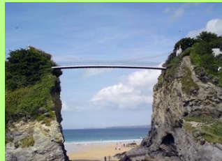
Towan Beach, Cornwall