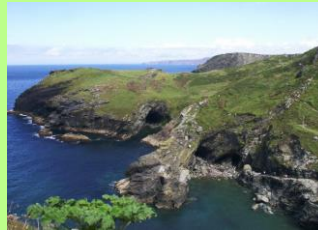
Caves in Tintagel, Cornwall