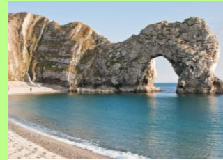
Durdel Door, Dorset