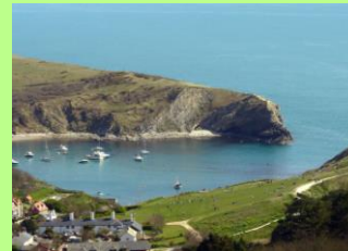
Lulworth Cove, Dorset